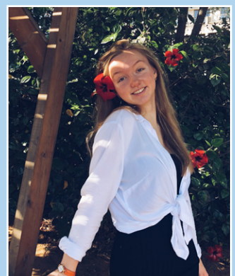
Sophia Cap Dakota Collegiate

We are extremely proud to announce the 2019 Scholarship recipients: