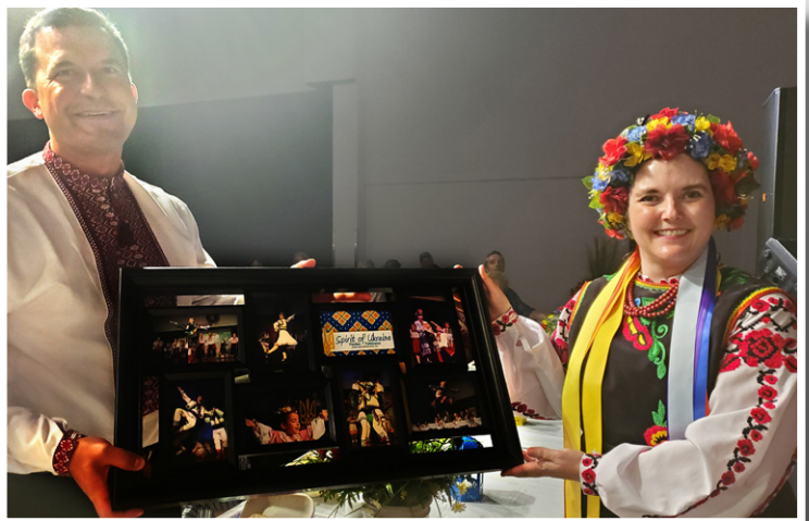
Spirit of Ukraine